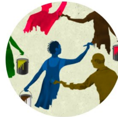
Strengthening Families and Communities