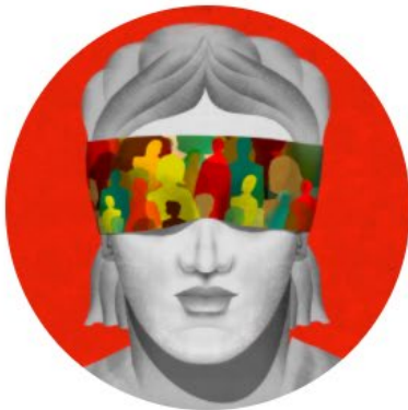
Securing Equal Justice