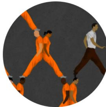
Ending Mass Incarceration